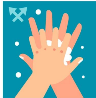
SCRUB BETWEEN YOUR FINGERS