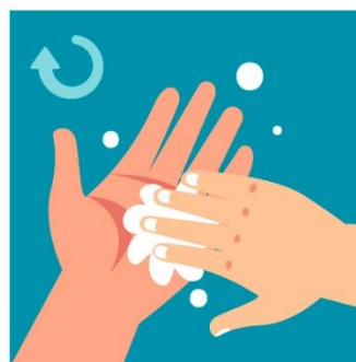
WASH YOUR FINGERNAILS AND FINGERTIPS