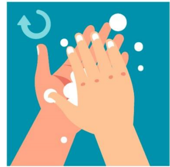
RUB HANDS PALM TO PALM