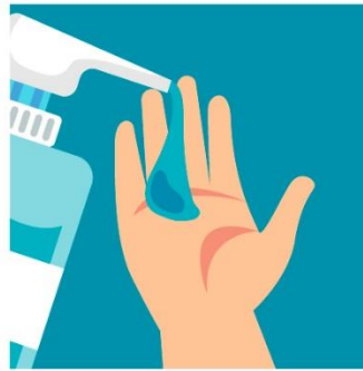
APPLY ENOUGH SOAP TO COVER ALL HAND SURFACES