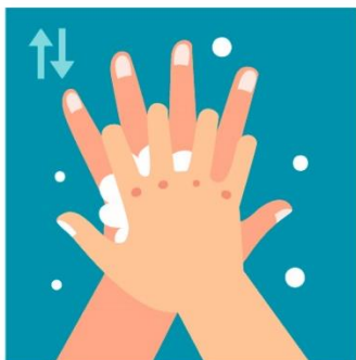
LATHER THE BACKS OF YOUR HANDS