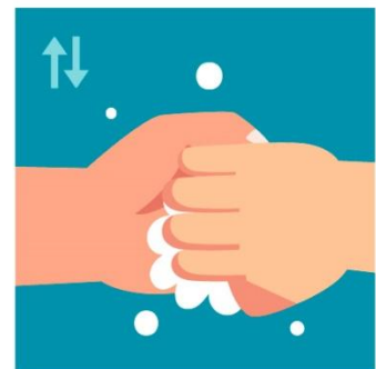
RUB THE BACKS OF FINGERS ON THE OPPOSING PALMS