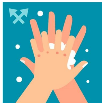
SCRUB BETWEEN YOUR FINGERS